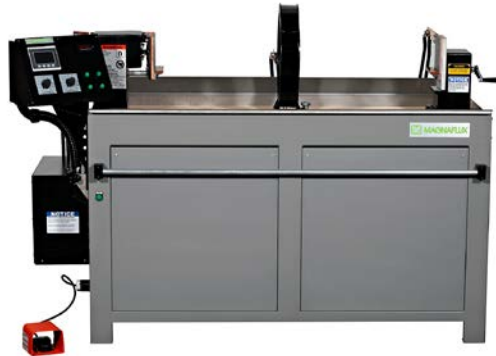
ADH-2045 Long Frame Unit